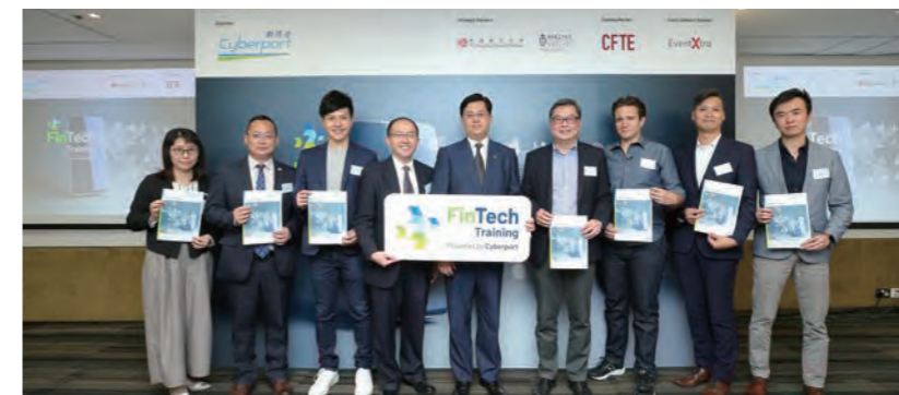
The Cyberport Financial Practitioners FinTech Training Programme was launched in March 數碼港於三月推出「數碼港金融從業員金融科技培訓計劃」

Accelerated digital transformation is spurring practitioners across industries to gain new skills and credentials, and the need for FinTech skills in the financial sector is especially pronounced. In response to the government's call for enhanced FinTech training for financial practitioners in last year's Policy Address, Cyberport was entrusted by the Financial Services and the Treasury Bureau to debut the Cyberport Financial Practitioners FinTech Training Programme in March 2020. The programme, which features a series of seminars and workshops over a year, enriches Hong Kong's FinTech talent pool, promotes FinTech adoption by financial institutions, speeds up digital transformation, and fortifies our competitiveness as an international financial centre. Nearly 2,000 practitioners are expected to benefit from the programme, and they will receive a government subsidy of 80 per cent of the training fee.