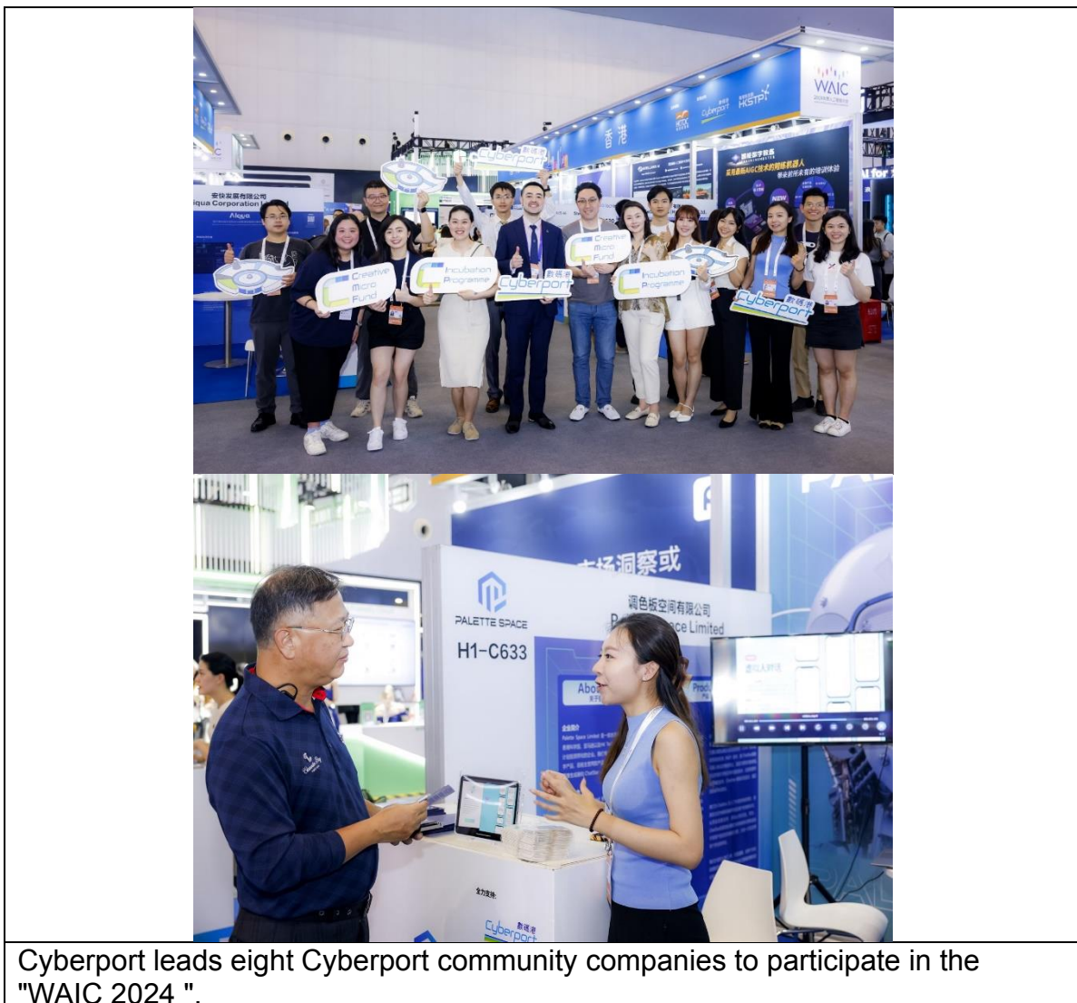
Cyberport leads eight Cyberport community companies to participate in the "WAIC 2024".

For high-resolution photos, please download via this link.