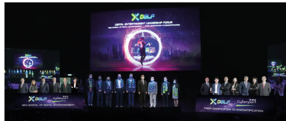
The two-day Digital Entertainment Leadership Forum 2020 was held in a virtual and interactive format. 一連兩日「2020數碼娛樂領袖論壇」以虛擬互動形式舉行。

縱然疫情導致實體電競賽事難以舉行，仍然無礙我們推動數碼娛樂和電競產業的整體發展。「 2020數碼娛樂領袖論壇 」以「數碼娛樂新常態：從遊戲邁向電競」為主題，透過虛擬互動形式進行。是次活動的逾70位講者來自遊戲、娛樂、體育、電競、科技和教育等多元化範疇，電競表演賽及線上賽事亦於論壇期間同步進行。活動網上平台錄得來自接近30個國家或地區的超過60萬次瀏覽量。