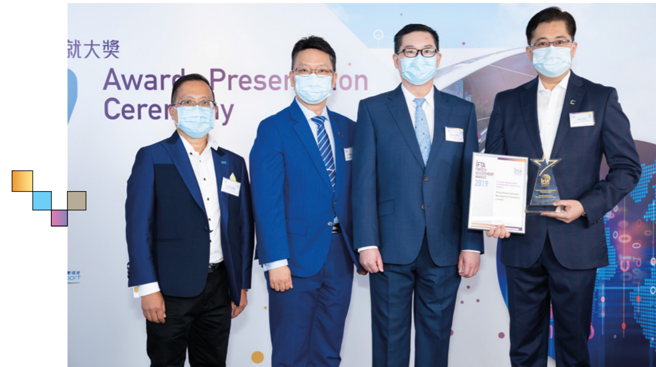
In recognition of the efforts in nurturing FinTech start-ups, Cyberport was awarded the FinTech Ecosystem Contribution Honorary Award. 數碼港致力培育金融科技初創，努力備受認可，獲頒「金融科技生態貢獻獎」。

數碼港金融科技社群繼續保持全港最大的規模。根據投資推廣署的資料，本港有逾600家金融科技公司及初創企業，當中接近400家屬於數碼港金融科技社群，佔整體數目的三分之二。數碼港金融科技社群除了涵蓋香港所有虛擬保險公司（保泰人壽、OneDegree、眾安國際、安我保險）及兩家虛擬銀行（匯立銀行和眾安銀行），我們的金融科技生態圈亦更見多元和成熟。為表揚數碼港在培育金融科技初創，以及促進金融業數碼轉型的貢獻，數碼港於亞洲金融科技師學會「IFTA 金融科技成就大獎」中，獲頒發「金融科技生態貢獻獎」。