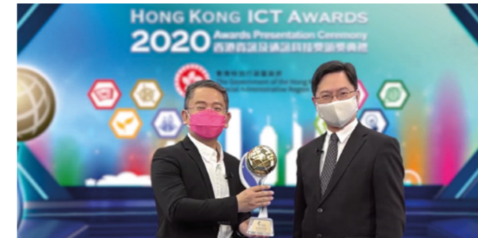
Maphive Technology, with its barrier-free indoor navigation platform, won the "Smart Mobility Grand Award" and the Gold Award in the "Smart Mobility (Smart Tourism)" stream at Hong Kong ICT Awards 2020.

Internationally, at the revered JUMPSTARTER 2021 , organised by the Alibaba Entrepreneurs Fund to recognise the world's best innovators and innovations, 24 Cyberport community companies were shortlisted into the Top 200. Two Cyberport start-ups even claimed four of the top awards. Rice Robotics nabbed the illustrious JUMPSTARTER 2021 award, the "Best JUMPSTARTER - Smart City" award, and the "Social Impact Startup Award", while Benefit Vantage claimed the "Best JUMPSTARTER - FinTech" award. At the World Summit Awards 2020 , CoronAI and IPification were the only two companies from Hong Kong recognised for exemplary social impact in the categories of "Health & Well-Being" and "Business & Commerce" and for advancing the United Nations' (UN) Sustainable Development Goals.