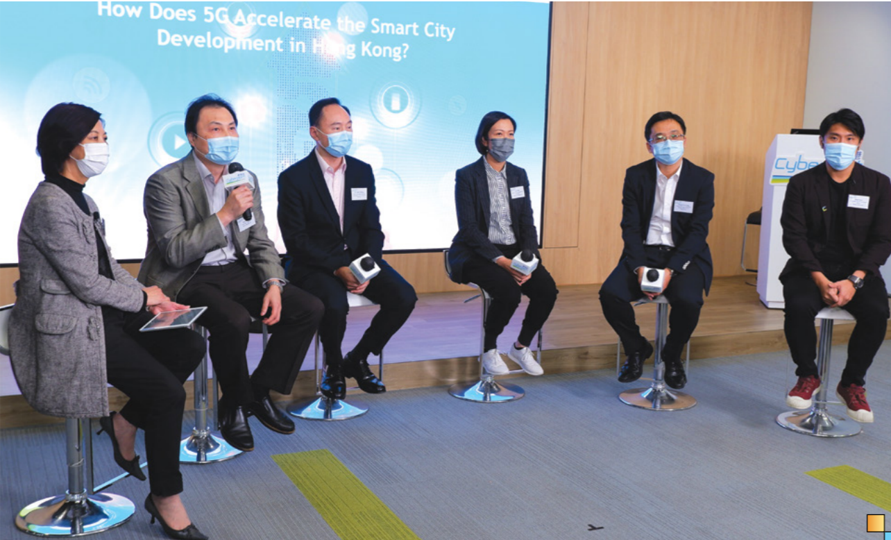
Through Cyberport Community Connect programme, four major telecommunications service providers and Cyberport start-ups explored how 5G accelerated the development of smart city and digital entertainment in Hong Kong. 四大電訊商與數碼港初創透過「Cyberport Community Connect」計劃，探討5G如何推動香港在智慧城市及數碼娛樂的發展。

數碼港繼續加強與資訊及通訊科技行業不同組織之間的互動，以推動業界發展及鞏固行業聯繫。2020/21年度，數碼港與香港無線科技商會、香港零售科技商會及香港通訊業聯會合作，舉辦「Cyberport Community Connect」主題網上研討會，促進業界交流。網上研討會涵蓋物聯網、零售科技、線上到線下營銷模式（O2O）／數碼營銷、擴增實境／虛擬實境（AR/VR）、電競、數碼娛樂、智慧城市和5G。六家數碼港社群公司，分別為Softhard.IO、Mad Gaze、和田升当、Mojodomo、路邦科技和Formula Square，獲邀與業界知名人士討論行業趨勢、挑戰和前景。超過130位業界領袖和專業人士參與多個環節，互相交流意見和見解。活動備受與會者歡迎，超過八成受訪者在回應評價時，認為活動裨益良多。