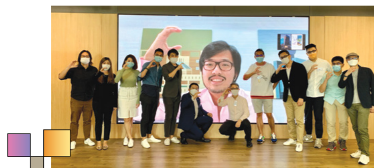
Cyberport's start-ups joined a Design Thinking Workshop with Cyberport Enterprise Network members New World Development and Ho & Partners Architects Engineers & Development Consultants Ltd.

數碼港初創參加由「數碼港企業網絡」成員新世界發展及何顯毅建築工程師樓地產發展顧問有限公司舉辦的設計思維工作坊。