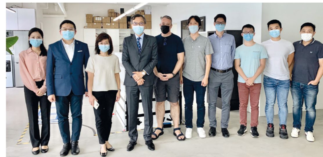
Cyberport Enterprise Network arranged visit for the Haven of Hope Christian Service to Descamps. Technology's office to explore possible collaboration. 「數碼港企業網絡」為基督教靈實協會安排到訪德柯斯科技的辦公室，探討合作機會。

事實上，許多企業已視數碼港為尋找創新方案的一站式服務點，成為他們創新團隊的後援。「數碼港企業網絡」亦促成了不少成功例子，當中包括基督教靈實協會與物聯網初創企業德柯斯科技合作的概念驗證，協會經營的護理院和服務中心將會裝置20個智能感測器，為長者護理服務提供協助。