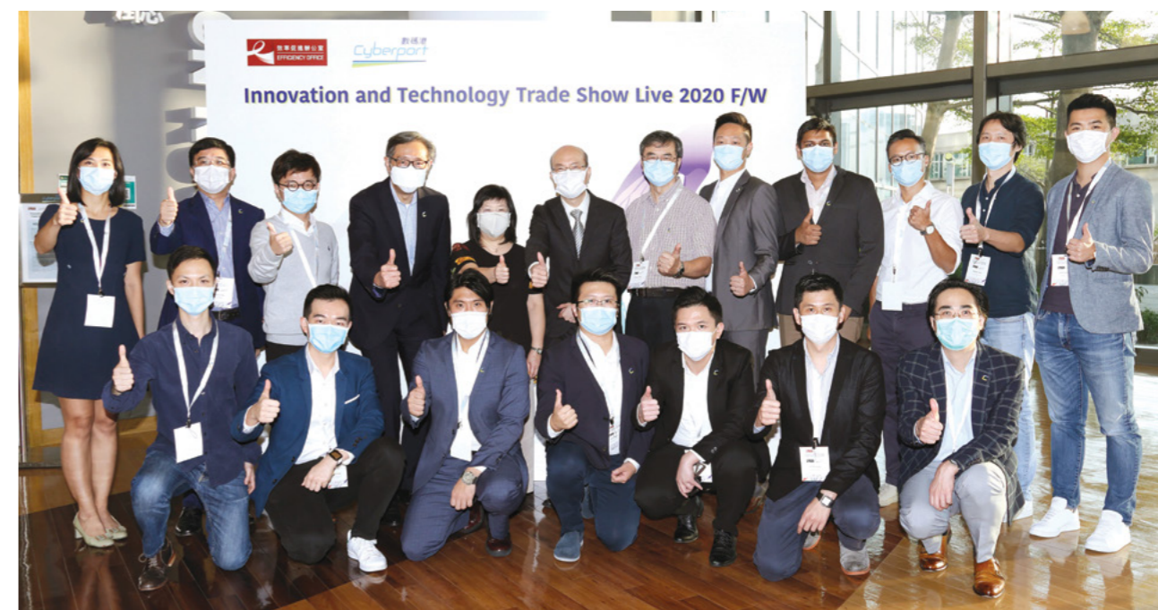
A total of 20 Cyberport community members pitched their solutions to officials representatives from Government bureaux and departments at the Innovation and Technology Trade Show Live 2020 F/W.

另外，我們的初創企業亦參與由機電工程署舉辦的虛擬「機電創科日2020」。同時亦有方案於年內新增至機電工程署的「機電創科網上平台」，該平台羅列各政府部門對數碼方案的需求，讓創科業界提供相應的創新科技解決方案以作配對。