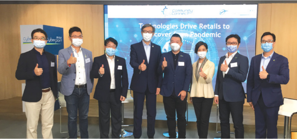
Co-presented by Cyberport Community Connect and HKRTIA, the webinar invited marketing and sales veterans, as well as our start-up members to share their insights on recovery through technologies. 由「Cyberport Community Connect」夥同香港零售科技商會舉行的網上活動，請來多位具營銷經驗的嘉賓及數碼港初創企業，向業界分享如何善用科技突破當前困局。