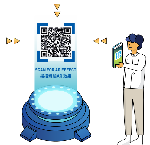
Cyberport Venture Capital Forum 2020 數碼港創業投資論壇 2020

「數碼港創業投資論壇」首次以虛擬方式舉行，活動的網上平台錄得近100,000次的瀏覽觀看。