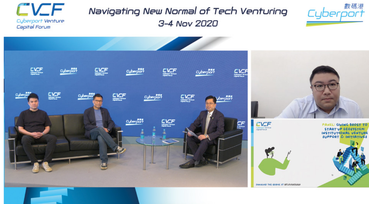
Cyberport Venture Capital Forum (CVCF) 2020 was held virtually for the first time and invited more than 60 international and local investors, entrepreneurs, start-ups and academics to shed light on "Navigating the New Normal of Tech Venturing".

論壇不但提供行業知識和市場資訊，亦為初創企業創造與投資者互動機會。論壇吸引大批國際投資者參與，讓初創向其展示方案並磨練演示技巧，為期兩天的活動合共安排了逾250場投資者與初創企業的一對一會面，當中初創媒體Jumpstart Media亦為數碼港初創企業安排專門的配對環節，以帶動更多集資機會。