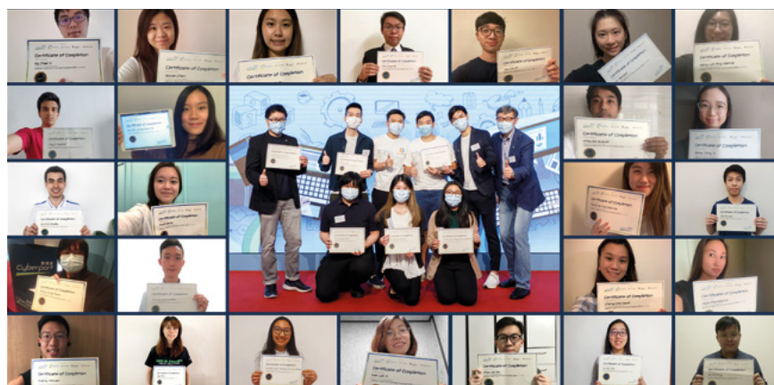
Cyberport Academy is established with the aim of further enriching Hong Kong's technology talent pool and enhancing Hong Kong's overall I&T competitiveness.

數碼港成立數碼港學院，旨在進一步擴大香港的科技人才庫，提升香港的整體創科競爭力。