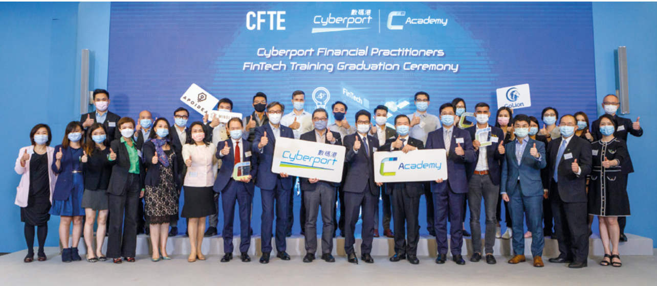
With enthusiastic support from the financial institutions, over 1200 in-service financial practitioners participated in the Cyberport Financial Practitioners FinTech Training Programme. 「數碼港金融從業員金融科技培訓計劃」獲1,200多位金融從業員參與，反應熱烈。

為表揚參與的金融機構，在計劃期間採用數碼港初創企業研發的金融科技應用方案，數碼港向星展銀行及銀通頒發「 金融科技數碼轉型獎 」。同時亦向有最多員工參與培訓環節的中國銀行，頒發「 金融科技人才發展獎 」。此外，五位分別來自三井住友銀行、中國民生銀行和東亞銀行的員工，獲頒發「 金融科技人才獎 」，以表揚他們完成最多培訓環節。