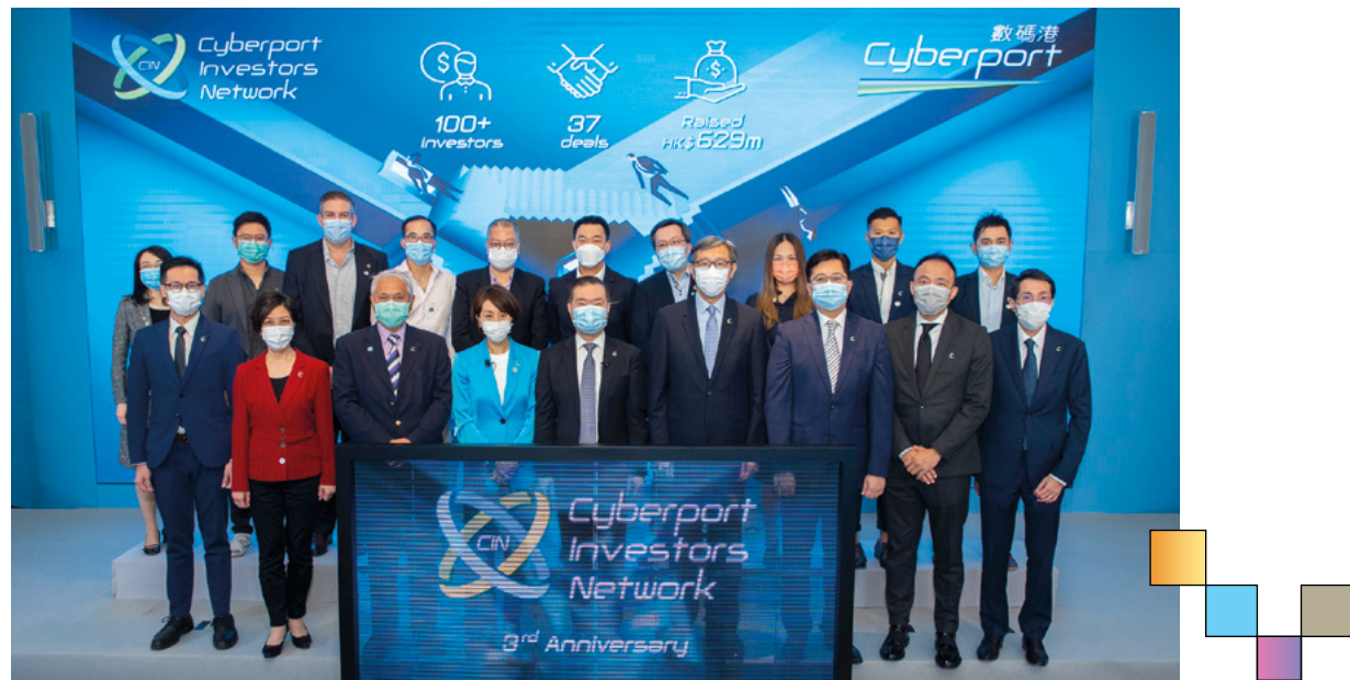
On its 3rd anniversary, Cyberport Investors Network (CIN) has lined up over 100 investors and generated over HK$6 million's worth of investment. “数码港投资者网络”成立三年间，已获得超过100位投资者支持及超过600万港元投资。