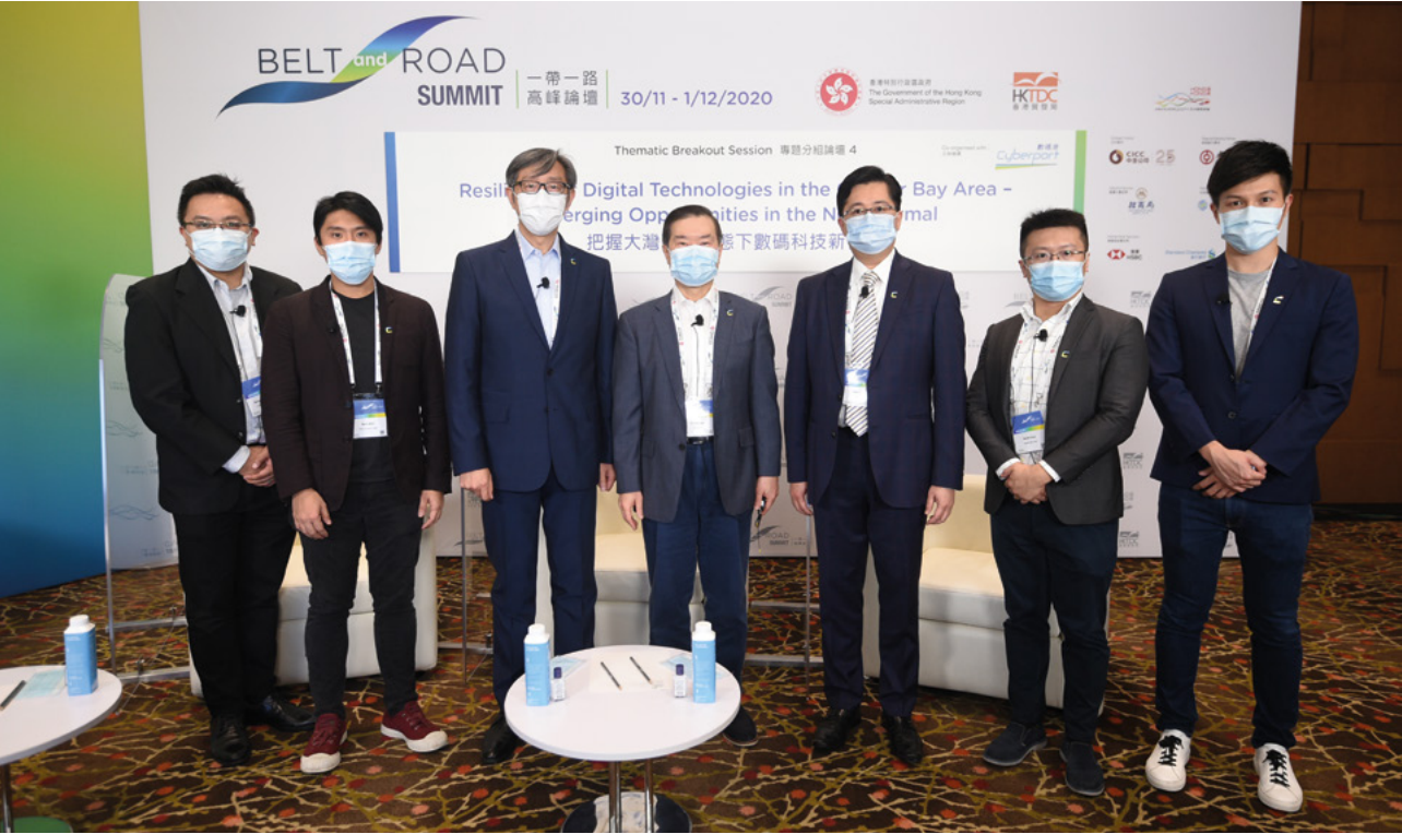
At Belt and Road Summit 2020, Cyberport and community start-ups shed light on emerging opportunities for digital technologies development in the GBA. 数码港及社群初创在“一带一路高峰论坛2020”就大湾区的数字科技新机遇交流意见心得。

数码港将密切留意国内外的新机遇，不断完善及调整我们的支援计划，以更有效发挥对科创生态系统和香港社会经济发展的影响。国家于“十四五”规划下提出的“双循环”经济策略、《区域全面经济伙伴关系协定》、《粤港澳大湾区发展规划纲要》、“一带一路”倡议、香港实施的《香港智慧城市蓝图2.0》，以及种种在金融科技、智慧生活、数字娱乐和电竞方面的进一步发展，将让科技创新社群发光发热。香港具有充分的能力掌握这些发展，数码港将全力以赴，引领香港的科创界做好准备，以巩固我们作为亚洲领先数字科技枢纽和智能经济的地位。