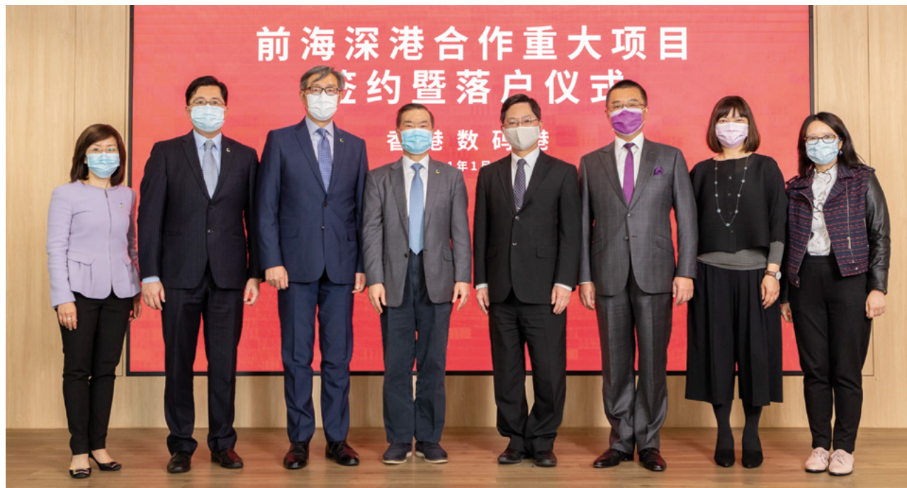
Cyberport and the Authority of Qianhai Shenzhen-Hong Kong Modern Service Industry Cooperation Zone (the Authority of Qianhai) inked the MoU to deepen cross-border collaboration, driving I&T development in the GBA.

为延伸香港在科技上和地理上的优势，数码港把联系网络扩大至广州南沙、深圳前海和珠海横琴，致力让香港初创企业和科技公司能更顺利地走进蓬勃发展的大湾区市场。我们同时与深圳市前海管理局，以及马来西亚数字经济机构签署了合作谅解备忘录，提升初创企业于当地开展业务的双边便利，促进信息交流，并吸引更多的海外人才来港。此外，数码港于2020年获国家科学技术部认可为“国家级科技企业孵化器”，以表扬我们在培育和孵化科技公司方面的成就。我们将一如既往为初创企业和年轻企业人才提供强力支持，致力成为海外初创企业和科技公司的区域总部，将香港打造成中国的国际科创枢纽。