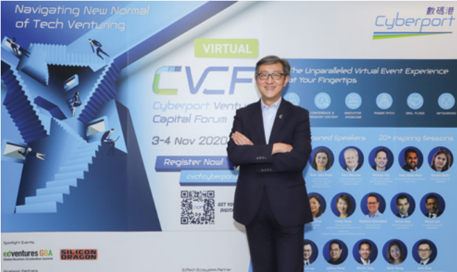
Cyberport Venture Capital Forum (CVCF) 2020 attracted nearly 100,000 views and facilitated over 300 deal flows. “数码港创业投资论坛2020”吸引近10万次浏览量, 并促成超过300个项目配对。

年度标志性活动“数码港创业投资论坛2020”首次于线上进行, 汇聚超过60位业界名人、投资者、初创企业和学术界成员, 共同探讨“领航科技创投新常态”, 吸引近10万次浏览量。同场还包括近50个项目提案演示、120多个科技创新展示, 并促成了超过300个项目配对, 相较2019年论坛的30个展示和约200个项目配对大幅提升。有见疫情期间教育科技发展强劲, 数码港及“薯片叔叔共创社”联手在论坛期间举办“全球教育企业峰会”, 探索教育科技的全球发展, 并鼓励教育科技初创放眼国际市场。