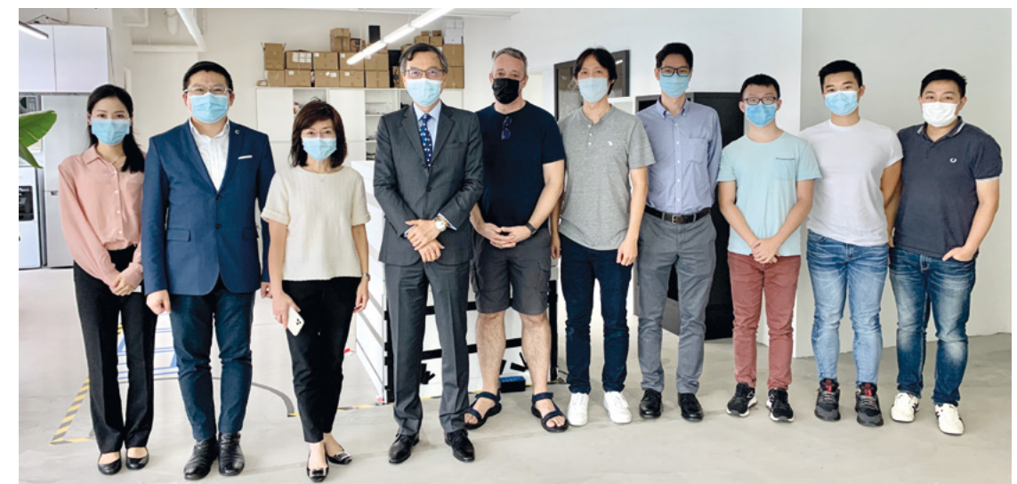
Cyberport Enterprise Network arranged visit for the Haven of Hope Christian Service to Descamps. Technology's office to explore possible collaboration. “数码港企业网络”为基督教灵实协会安排到访德柯斯科技的办公室，探讨合作机会。

事实上，许多企业已视数码港为寻找创新方案的一站式服务点，成为他们创新团队的后援。“数码港企业网络”亦促成了不少成功例子，当中包括基督教灵实协会与物联网初创企业德柯斯科技合作的概念验证，协会经营的护老院和服务中心将会装置20个智能感测器，为长者护理服务提供协助。