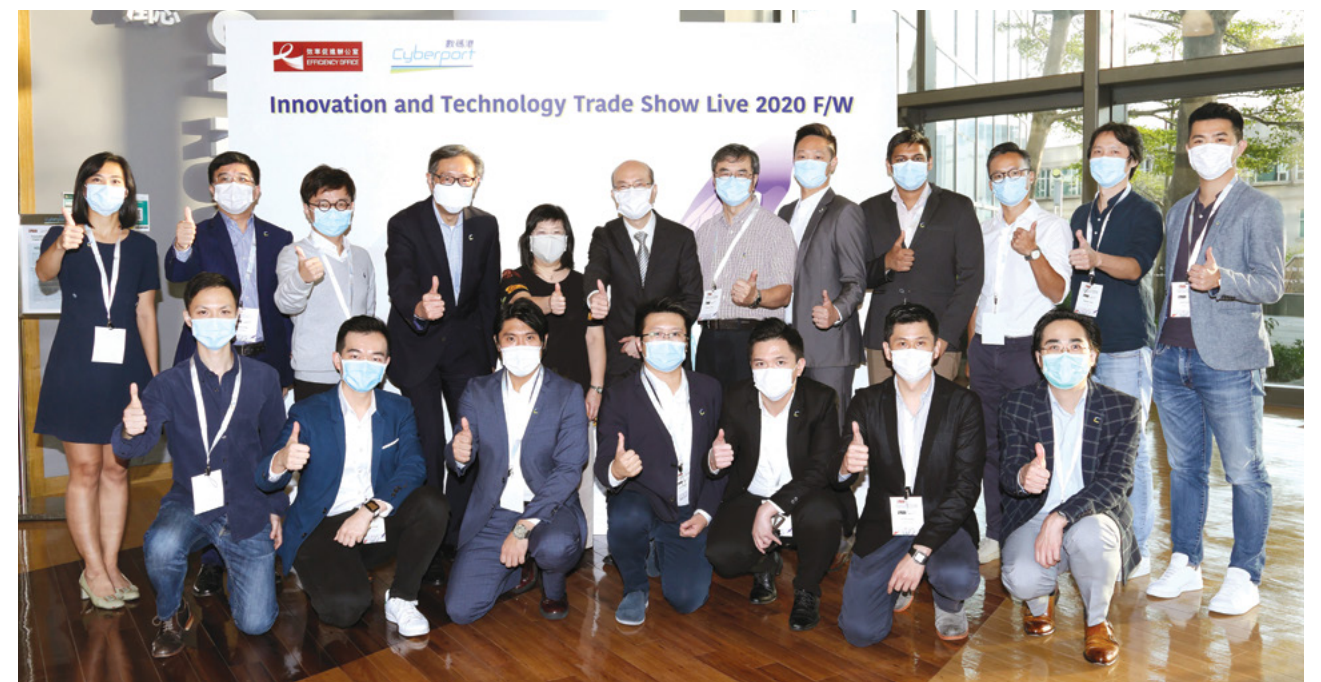
A total of 20 Cyberport community members pitched their solutions to officials representatives from Government bureaux and departments at the Innovation and Technology Trade Show Live 2020 F/W.

另外，我们的初创企业参与了由机电工程署举办的虚拟“机电创科日2020”。同时亦有方案于年内新增至机电工程署的“机电创科网上平台”，该平台罗列各政府部门对数字方案的需求，让科技业界提供相应的科技创新解决方案以作配对。