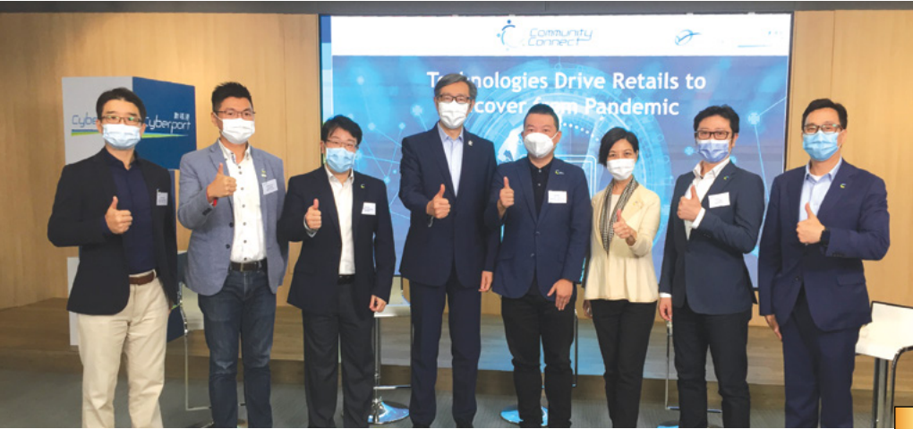
Co-presented by Cyberport Community Connect and HKRTIA, the webinar invited marketing and sales veterans, as well as our start-up members to share their insights on recovery through technologies. 由“Cyberport Community Connect”伙拍香港零售科技商会举行的线上活动，请来多位具营销经验的嘉宾及数码港初创企业，向业界分享如何用科技突破当前困局。