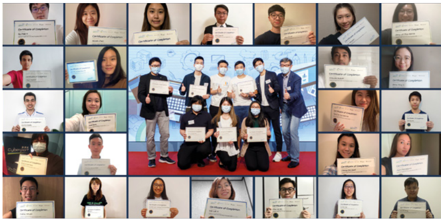
Cyberport Academy is established with the aim of further enriching Hong Kong's technology talent pool and enhancing Hong Kong's overall I&T competitiveness. 数码港成立数码港学院，旨在进一步扩大香港的科技人才库，提升香港的整体科创竞争力。

Under the umbrella of Cyberport Academy, Cyberport Digital Tech Internship Programme (CDTIP) continued to provide students with hands-on experiences in start-up settings. 120 student participants were able to get a taste of entrepreneurship by interning with 40 companies in the fields of Fintech, digital entertainment, and smart living. Through collaboration with various faculties of tertiary institutions, Cyberport Scale-up Placement Programme matched 53 start-ups with 91 university students for credit-bearing practicums to contribute their expertise from their studied disciplines to start-ups. Startup 101 Training Day 2020 was hosted to help 86 students gain essential skills in entrepreneurship.