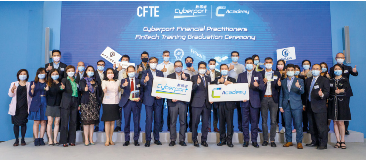
With enthusiastic support from the financial institutions, over 1200 in-service financial practitioners participated in the Cyberport Financial Practitioners FinTech Training Programme. “数码港金融从业员金融科技培训计划”获1,200多位金融从业员参与，反应热烈。

为表扬参与的金融机构，在计划期间采用数码港初创企业研发的金融科技应用方案，数码港向星展银行及银通颁发“ 金融科技数码转型奖 ”。同时亦向有最多员工参与培训环节的中国银行颁发“ 金融科技人才发展奖 ”。此外，五位分别来自三井住友银行、中国民生银行和东亚银行的员工获颁发“ 金融科技人才奖 ”，以表扬他们完成最多培训环节。