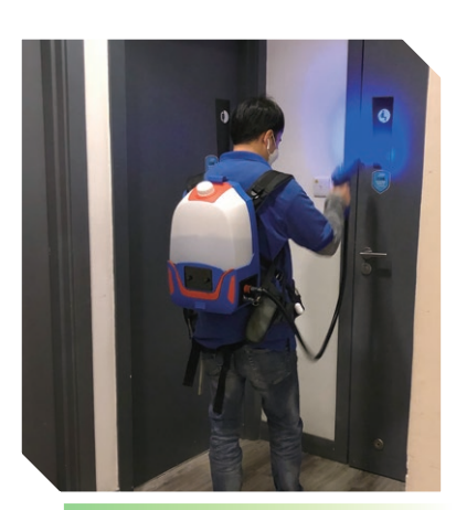
We applied anti-epidemic coatings to communal areas on the Cyberport campus. 我們在數碼港園區內的公共區域噴灑抗病毒殺 菌塗層。

為嚴防新冠肺炎擴散,我們已採取適當措施,以確保 社群的健康與安全。我們在園區使用消毒機器人進行 日常消毒,又在公共區域噴灑抗病毒殺菌塗層,並在 入口設體溫檢測以篩選出有症狀的人士,還有其他常 規的防護措施。以上種種,都是為確保每個人的身體 健康,為抗疫出一分力。