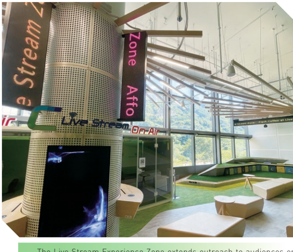
The Live Stream Experience Zone extends outreach to audiences on virtual platforms. 直播體驗區在虛擬平台上向觀眾延伸。