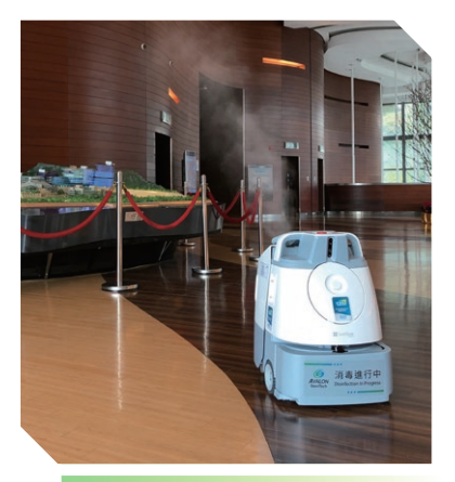
Disinfection robots make their rounds on campus to perform adequate cleaning and sterilisation to avoid the spread of illnesses. 消毒機器人在園區內巡視,進行充分的清潔和消 毒,避免疾病傳播。