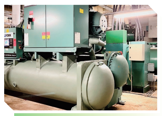
As part of the AI chiller plant optimisation system, we have installed new chiller plant systems with energy saving features. 作為人工智能冷水機組優化系統的一部分,我們安裝了具有節能功能的新冷水 機組系統。

我們正在進行為期兩年的冷水機組系統升級項目,預 計於2023年初完成。項目範疇包括更換已經老化的冷 水機組和熱交換器,並裝上人工智能冷水機組優化系 統。由於新系統能根據實際降溫需求進行自動調整, 能最大限度地減少控制操作及調整能源使用的人力。 透過節約能源和電力,數碼港能夠減少溫室氣體排 放,為推動綠色低碳社會作出貢獻。