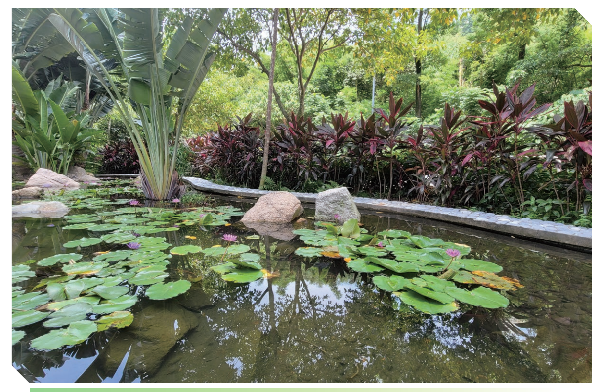
An array of flora and fauna surrounding the newly constructed Lotus Flower Pond. 新建成的蓮花池周圍有一系列植物增加綠化空間。

我們亦關心租戶的心理健康,明白富美感的空間、無 障礙的環境,能有益身心健康。數碼港在園區新建一 個蓮花池,讓數碼港用戶及訪客有一個放鬆及休憩的 區域。至於商場,我們採取了對 寵物友善的措施 ,為 寵物主人提供更多便利。