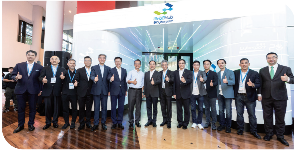
Cyberport Web 3 Living Lab was opened in August 2023 to showcase the latest Web3 innovations to raise the public awareness of possibilities for application in this new sphere.

「數碼港Web3生活體驗館」於2023年8月開幕，旨在向大眾展示最新Web3創新技術，讓大眾加深認識這個嶄新領域的應用潛力。