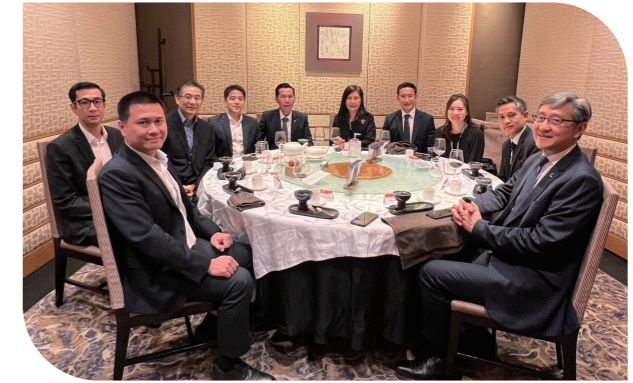
Thailand Digital Economy Promotion Agency (DEPA) visited Cyberport, fostering tech exchange with other Asian tech hubs. 泰國數字經濟促進辦公室(DEPA)訪問數碼港，促進與其他亞洲科技中心的科技交流。