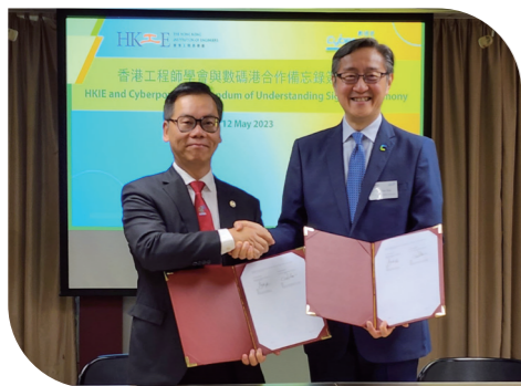
Cyberport and the Hong Kong Institution of Engineers signed an MoU to encourage more engineers to embrace entrepreneurship and to provide solutions for pain points in society. 數碼港及香港工程師學會簽署合作備忘錄，鼓勵更多專業工程師成為創業者，為社會不同痛點提供解決方案。