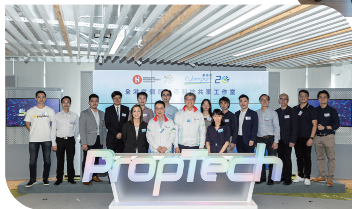
The first-ever property technology (PropTech) Co-Working Space in Hong Kong, jointly established by Cyberport and the Hong Kong Housing Society, was launched to steer PropTech development in the Northern Metropolis. 數碼港與香港房屋協會攜手成立的全港首個房地產科技共享工作室已經啟用，率先在北部都會區啟動房地產科技發展。