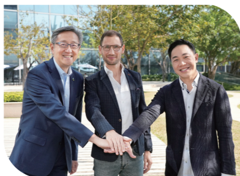
Cyberport's first co-investment with MTR Lab: alfred24, a Hong Kong-based logistic technology start-up, aims to further drive the development of smart city and smart mobility. 數碼港與MTR Lab首次共同投資初創項目—香港物流科技初創企業alfred24，以期進一步推進智慧城市及智慧出行的發展。

In the Smart Living/smart city cluster, start-ups and companies have mounted to about 770, including two unicorn enterprises. Cyberport has been granted HK$265 million by the HKSAR Government to implement the Incubation Programme for Smart Living Start-ups . This programme injects new energy into Hong Kong's smart city development and intends to enhance the quality of life for the public with technology. During the year, Cyberport established collaborations with leading enterprises, such as DMALL, JS Global Lifestyle, and China Resources Group, to jointly promote smart retail, logistics, and digital business solutions. The first-ever property technology (PropTech) co-working space in Hong Kong, jointly established by Cyberport and the Hong Kong Housing Society, was launched to steer PropTech development in the Northern Metropolis, while enabling start-ups to develop innovative solutions and conduct proof-of-concept and testing. Cyberport also collaborated with the Construction Industry Council and the Hong Kong Institution of Engineers to promote construction technology and industry innovation. Furthermore, Cyberport and MTR Lab collaboratively invested in start-ups whose solutions cater to the business needs of the MTR Corporation. alfred24, a logistics technology start-up, was the recipient of the first co-investment, aiming to launch low-energy consumption logistics solutions for sustainable development.