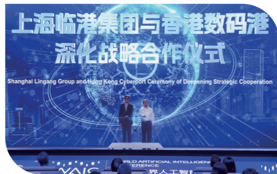
In March 2023, Cyberport signed a MoU with Lingang Group to establish a comprehensive strategic partnership as "sister parks" to facilitate enterprises in the two communities to expand into the Mainland and overseas markets respectively, and the strategic cooperation has been deepened subsequently. In 2023年3月，數碼港與臨港集團簽署合作備忘錄，以「姐妹園區」的方式建立全面戰略合作關係，協助對方園區的企業，分別開拓內地及海外市場，其後持續深化戰略合作。

數碼港積極延攬重點企業落戶，包括專注研發人工智能的龍頭企業壁切科技、亞洲最大智能零售平台多點DMALL；同時著力拓展在內地及海外的創科生態網絡，分別與華潤創業、上海臨港集團、農銀國際簽署合作備忘錄，促進兩地的創新人才交流，科技、信息等創新資源融通。數碼港亦與迪拜未來基金會簽訂合作備忘錄，推動兩地創科合作，並打通初創企業投入中東市場的渠道。我們亦接待中東及東盟代表團參觀數碼港，促進培育創新創業多邊交流。