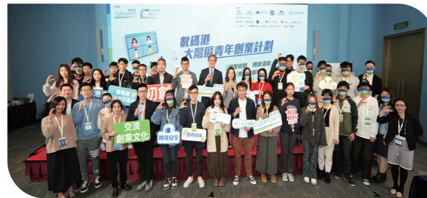
The Cyberport Greater Bay Area Young Entrepreneurship Programme this year attracted applications from students of more than 50 universities and higher education institutions in Guangdong, Hong Kong, and Macau. The programme selected 200 young individuals for a four-day entrepreneurship boot camp, fostering cross-boundary exchange and I&T collaboration among young talent in the Greater Bay Area. 本年度「數碼港大灣區青年創業計劃」吸引來自粵港澳三地超過50間大學及高等院校的學生申請，並選出200名青年參加一連四日創業營，促進大灣區內青年交流以及跨區創科協作。

把握大灣區發展機遇，「 數碼港大灣區青年創業計劃 」年內吸引粵港澳逾50所高等院校200多名學生，開展合作項目，至今已匯聚超過2,500名大灣區青年參加。其中超過170個創新項目獲得「 數碼港創意微型基金 」資助，26個隊伍更其後入選「 數碼港培育計劃 」。