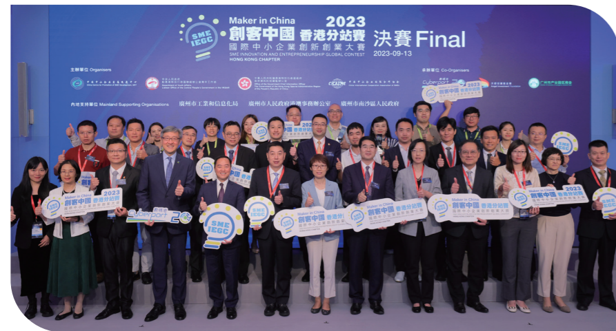
MiC Hong Kong Chapter attracted approximately 150 teams to participate, with the Cyberport community securing the first and second places respectively. 「創客中國」香港分站賽吸引約150隊伍參賽，數碼港社群更分別奪得冠亞軍。

數碼港繼續舉辦多項年度矚目的大型行業活動，在全球復甦之初，數碼港與香港特區政府聯手復辦亞洲科創盛事「 數字經濟峰會 」（前身為「互聯網經濟峰會」），前瞻可持續發展的數字社會。峰會獲得超過4,000人次參與，創下峰會的新紀錄。數碼港亦再度舉辦「 數碼港創業投資論壇 」探討創業投資新動力，吸引約2,500人參與，促成逾300場一對一會面的融資配對。數碼港連續第三年承辦創業盛事 2022「創客中國」國際中小企業創新創業大賽香港分站賽（「創客中國」香港分站賽） ，協助優秀初創企業投入大灣區市場。參賽隊伍逾150隊，再創紀錄，參賽項目合共涉及逾180個專利，數碼港初創企業濃說科技(Wizpresso)及尖思科研(Gense Technologies)分別勇奪冠、亞軍。