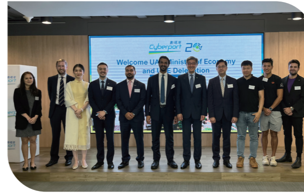
H.E. Abdulla bin Touq Al Marri, Minister of Economy of the UAE led a delegation to visit Cyberport to learn more about Hong Kong's I&T development. 阿聯酋經濟部長H.E. Abdulla bin Touq Al Marri率代表團到訪數碼港，了解香港創科發展。