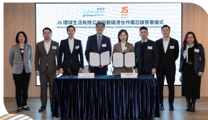
Cyberport and JS Global Lifestyle collaborated to promote innovative solutions such as smart retail and e-commerce. 數碼港與JS環球生活合作推動智慧零售及電子商貿等創新方案。