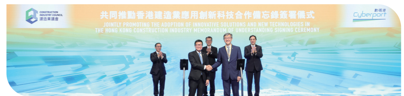
Witnessed by Paul Chan, Financial Secretary of HKSAR, Cyberport and the Construction Industry Council collaborated to enhance the productivity, quality, sustainability, and safety of construction works. 在香港特區政府財政司司長陳茂波見證下，數碼港及建造業議會合作，提高建築工程的生產力、質量、可持續性及安全性。

數碼港與香港金融管理局合作，繼續推出「 金融科技監管沙盒 」，加快金融科技產品在銀行的商業化及應用，亦繼續合作舉辦「 反洗錢合規科技實驗室 」，協助企業提升運用數據及科技的能力，以有效應對數碼詐騙及相關洗錢活動日益加劇的威脅。此外，我們與香港大學商學院合作舉辦「 引領金融科技創業 」計劃，培育具有金融科技思維的青年領袖人才。