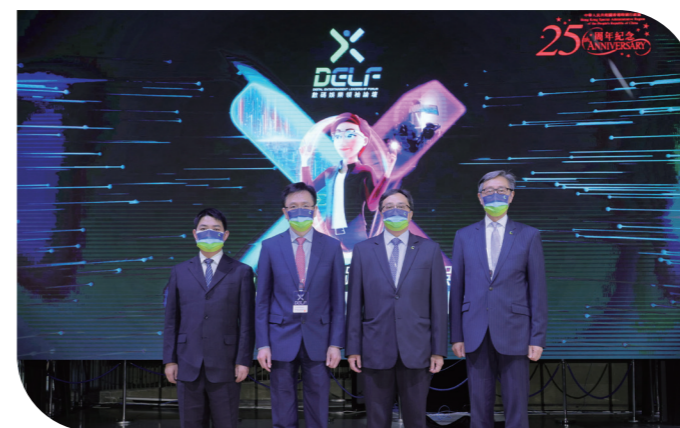
DELFF 2022 manifested the integration of virtuality and reality. 「2022數碼娛樂領袖論壇」展現了虛實交融的新視野。

In the realm of Digital Entertainment, we continued to organise the Digital Entertainment Leadership Forum (DELFF) 2022 , featuring Metaverse, ArtTech, and SportsTech experience zones, attracting over 2,800 participants from nearly 30 countries or regions. Cyberport is also actively expanding overseas connections in the industry, including organising the Asia MENA Culture Technology Economic Collaboration Forum , facilitating discussions between representatives from Hong Kong's cultural and creative industries and a delegation from Saudi Arabia on how Hong Kong can become a gateway for promoting exchanges in Asia and the Greater Middle East, as well as fostering international financial and cultural exchanges. We also organised the Scaling Hong Kong to the Nordics programme, allowing outstanding enterprises to visit game companies in Nordic countries to explore the latest business opportunities in the Nordic market. Throughout the year, we supported numerous esports events and competitions, including partnering with the Esports Association of Hong Kong to livestream the Asian Games Honor of Kings qualifiers.