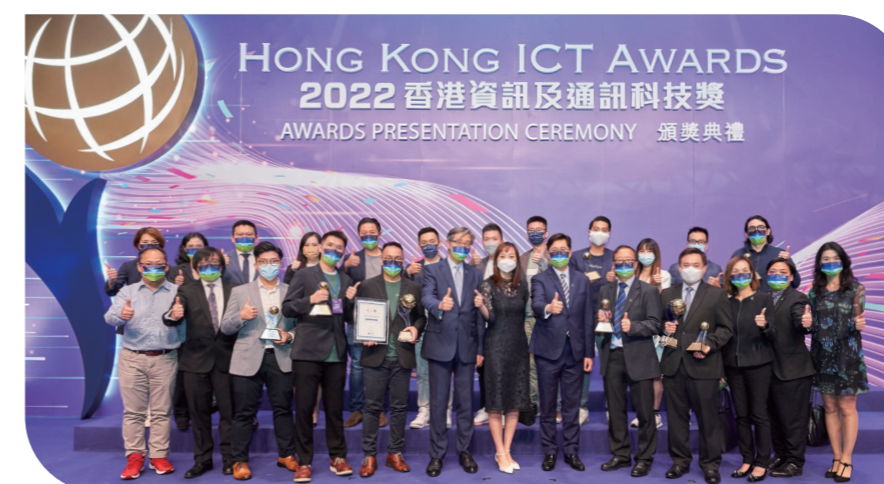
27 Cyberport start-ups won a total of 31 awards in 2022 Hong Kong ICT Awards. 27间数码港初创企业在“2022香港资讯及通讯科技奖”中共获31个奖项。

数码港社群的创新力量亦备受本地及国际业界肯定，其中，于“第二十届亚太资讯及通讯科技大奖(APICTA)”，社群企业勇夺2个大奖及3个优异奖；于“日内瓦国际发明展”，社群企业创新进阶(ITsci)及零动医疗科技(Zero Dynamic)分别夺得“评审团特别嘉许金奖”及“金奖”；而铠耀环境卫生科技(Avalon SteriTech)于“美国消费及电子展(CES)2022”机械人组别荣获创新奖；于“2022香港资讯及通讯科技奖”，27间数码港初创企业荣获31个奖项，包括三个大奖及九个金奖；于《经济通》“2022金融科技大奖”，数码港社群企业破纪录囊括最高殊荣的三项特别大奖，26间企业合共夺得29个奖项。