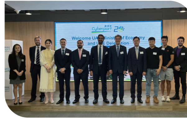
H.E. Abdulla bin Touq Al Marri, Minister of Economy of the UAE led a delegation to visit Cyberport to learn more about Hong Kong's I&T development. 阿联酋经济部长H.E. Abdulla bin Touq Al Marri率代表团到访数码港，了解香港科技发展。

In March 2023, Cyberport signed a MoU with Lingang Group to establish a comprehensive strategic partnership as "sister parks" to facilitate enterprises in the two communities to expand into the Mainland and overseas markets respectively, and the strategic cooperation has been deepened subsequently. In 2023年3月，数码港与临港集团签署合作备忘录，以“姐妹园区”的方式建立全面战略合作关系，协助对方园区的企业，分别开拓内地及海外市场，其后持续深化战略合作。