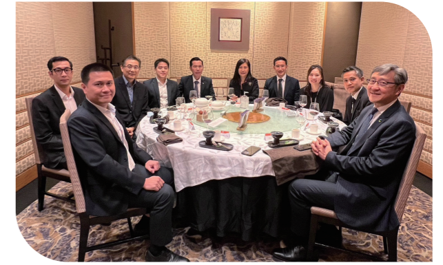
Thailand Digital Economy Promotion Agency (DEPA) visited Cyberport, fostering tech exchange with other Asian tech hubs. 泰国数字经济促进办公室(DEPA)访问数码港，促进与其他亚洲科技中心的科技交流。