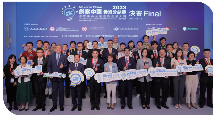
MiC Hong Kong Chapter attracted approximately 150 teams to participate, with the Cyberport community securing the first and second places respectively.

数码港继续举办多项年度瞩目的大型行业活动，在全球复常之初，数码港与香港特区政府联手复办亚洲科创盛事“数字经济峰会”（前身为“互联网经济峰会”），前瞻可持续发展的数字社会。峰会获得超过4,000人次参与，创下峰会的新纪录。数码港亦再度举办“数码港创业投资论坛”探讨创业投资新动力，吸引约2,500人参与，促成逾300场一对一会面的融资配对。数码港连续第三年承办创业盛事2022“创客中国”国际中小企业创新创业大赛香港分站赛（“创客中国”香港分站赛），协助优秀初创企业投入大湾区市场。参赛队伍逾150队，再创纪录，参赛项目合共涉及逾180个专利，数码港初创企业浓说科技(Wizpresso)及尖思科研(Gense Technologies)分别勇夺冠、亚军。