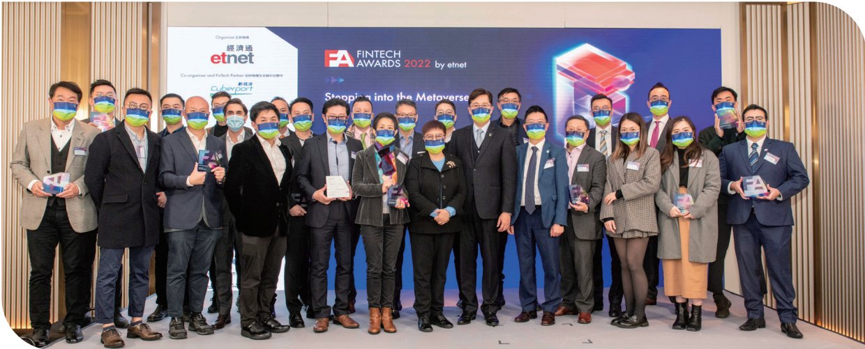
Our FinTech start-ups secured 29 awards across 15 categories at the ETNet FinTech Awards 2022, including all three FinTech of the Year awards. 於「經濟通2022金融科技大獎」評選中，我們的金融科技初創企業獲得15個組別的29個獎項，全數囊括三項年度特別大獎。

Additionally, community company Wizpresso was awarded the first BOCHK Science and Technology Innovation Prize. The company was also named champion at the Hong Kong chapter of the national “Maker in China” SME Innovation and Entrepreneurship Global Contest 2022 with its regulatory technology solution “Wizpresso Insight”, where another community company, Gense Technologies, finished first runner-up with its portable self-service medical imaging device for remote diagnosis screening and chronic disease monitoring.