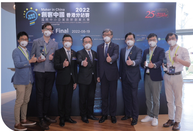
In “Maker in China” SME Innovation and Entrepreneurship Global Contest 2022, the Hong Kong Chapter, Cyberport community members, Wizpresso and Gense Technologies won the championship and First Runner-up respectively. 2022年「創客中國」國際中小企業創新創業大賽香港分站賽 ，數碼港社群成員濃說科技及尖思科研分別獲得冠亞軍。

此外，社群企業濃說科技榮獲首屆「中銀香港科技創新獎」。該公司亦於 2022年「創客中國」國際中小企業創新創業大賽香港分站賽 以監管科技解決方案「濃說洞察」摘冠，另一間社群企業尖思科研則以用於遠程診斷篩查和慢性疾病監測的便攜式自助醫學成像獲得亞軍。