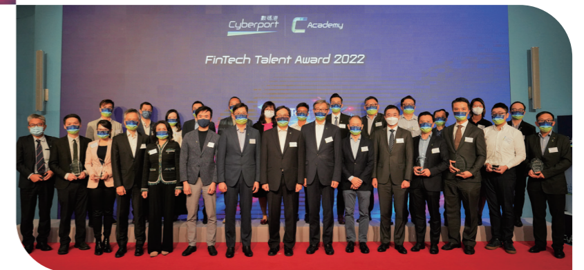
2022/23 Financial Practitioners FinTech Training Programme concluded successfully with overwhelming response from the financial industry. 2022/23年度「 金融從業員金融科技培訓計劃 」圓滿結束，金融業界反應踴躍。

Meanwhile, the incentive scheme enabled trade associations in the securities and insurance sectors to organise bespoke training programmes for their members. Throughout the year, seven programmes were held and enhanced knowledge for over 3,300 attendees.