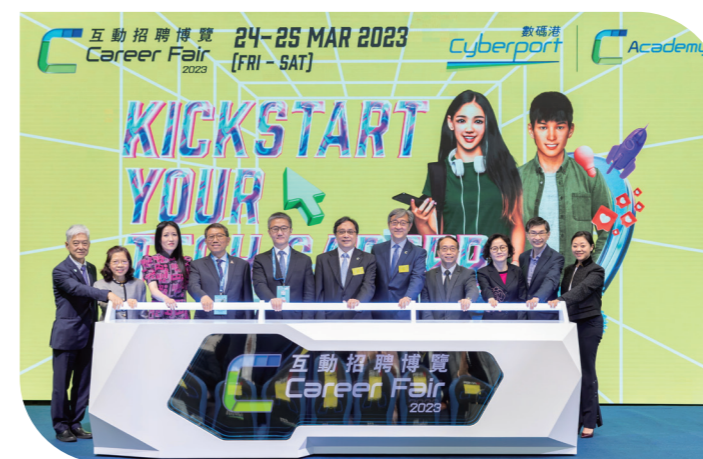
The opening ceremony of Cyberport Career Fair 2023 「數碼港互動招聘博覽2023」啟動禮

透過一年一度的「 數碼港互動招聘博覽 」，我們繼續為求職者與社群企業聯繫工作及實習機會。2023年招聘會Kickstart Your Tech Career（開展您的科技職業生涯）為主題，以混合形式舉行。逾180間公司及初創企業提供近1,500個創科職位，包括Web3、區塊鏈、NFT、STEAM教育、數碼藝術及其他熱門領域。此外，特設專門實習機會予有志投身創科界但未有相關經驗的畢業生。我們亦舉辦50多場職業分享會、招聘講座及履歷諮詢服務，協助求職者了解招聘趨勢，並提供AI面試分析及職業發展資源等線上服務。數碼港的綜合招聘平台「 iTalent 」讓求職人士與僱主可透過短訊及視像通話直接溝通。隨著創科職業越來越普及，該平台吸引超過30,000人次的瀏覽量，較2022年增長50%。