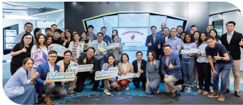
To celebrate Cyberport's recognition as a "State-level Scientific and Technological Enterprise Incubator" by the Ministry of Science and Technology (MOST) and the plaque unveiling ceremony, Cyberport invited community members to share the outstanding achievements. 為慶祝數碼港獲國家科學技術部（科技部）認可為「國家級科技企業孵化器」及舉行揭牌儀式，數碼港邀請數碼港社群企業出席慶祝活動，共享卓越成就。

數碼港在香港特區政府的推薦下，於2020年獲得國家科學技術部（科技部）認可為「國家級科技企業孵化器」，對數碼港培育創科創業人才的努力予以肯定，協力國家建設人才中心和創新高地。