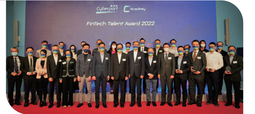
2022/23 Financial Practitioners FinTech Training Programme concluded successfully with overwhelming response from the financial industry. 2022/23年度“金融从业员金融科技培训计划”圆满结束，金融业界反应踊跃。

Meanwhile, the incentive scheme enabled trade associations in the securities and insurance sectors to organise bespoke training programmes for their members. Throughout the year, seven programmes were held and enhanced knowledge for over 3,300 attendees.