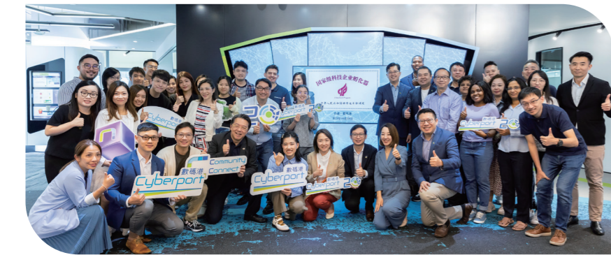
To celebrate Cyberport's recognition as a "State-level Scientific and Technological Enterprise Incubator" by the Ministry of Science and Technology (MOST) and the plaque unveiling ceremony, Cyberport invited community members to share the outstanding achievements. 为庆祝数码港获国家科学技术部（科技部）认可为“国家级科技企业孵化器”及举行揭牌仪式，数码港邀请数码港社群企业出席庆祝活动，共享卓越成就。

数码港在香港特区政府推荐下，于2020年获得国家科学技术部（科技部）认可为“国家级科技企业孵化器”，对数码港培育创新创业人才的努力予以肯定，协力国家建设人才中心和创新高地。