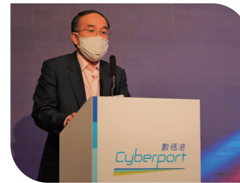
Christopher Hui, Secretary for Financial Services and the Treasury of HKSAR, was pleased to note the enthusiastic response of the trade towards the 2022/23 Financial Practitioners FinTech Training Programme , hoped that the programme could help expand Hong Kong's FinTech talent pool, and thanked Cyberport for implementing the Training Programme smoothly. 香港特区政府财经事务及库务局局长许正宇欣悉业界对2022/23年度“金融从业员金融科技培训计划”反应热烈，期望计划能壮大香港金融科技人才库，并感谢数码港使培训计划得以顺利推展。

银行、证券、保险及强积金等91间金融机构逾2,600名金融从业员参加12期网授课程，加强他们对合规科技、区块链、人工智能、数码港元、网络安全及环境、社会及管治(ESG)等金融科技应用的认识。除学费补贴外，完成培训的学员亦可获得由特许公认会计师公会、香港银行学会及香港律师会认可的区块链电子证书。我们与香港大学一渣打慈善基金金融科技学院合作开发该电子证书平台，助力广大社会建立一个可靠、安全的认证系统。