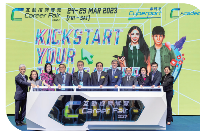
The opening ceremony of Cyberport Career Fair 2023 “数码港互动招聘博览2023”启动礼

透过一年一度的“ 数码港互动招聘博览 ”，我们继续为求职者与社群企业联系工作及实习机会。2023年招聘会Kickstart Your Tech Career（开展您的科技职业生涯）为主题，以混合形式举行。逾180间公司及初创企业提供近1,500个创科职位，包括Web3、区块链、NFT、STEAM教育、数码艺术及其他热门领域。此外，特设专门实习机会予有志投身创科界但未有相关经验的毕业生。我们亦举办50多场职业分享会、招聘讲座及履历咨询服务，协助求职者了解招聘趋势，并提供AI面试分析及职业发展资源等线上服务。数码港的综合招聘平台“ iTalent ”让求职人士与雇主可透过短讯及视像通话直接沟通。随着创科职业越来越普及，该平台吸引超过30,000人次的浏览量，较2022年增长50%。