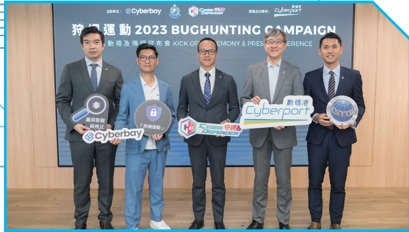
Cyberbay and the Hong Kong Police Force jointly organised the "BugHunting Campaign" to assist the SMEs and start-ups in improving their network safety performance. Cyberbay與香港警務處聯手舉辦「狩網運動」，助力中小企及初創提升網絡安全表現。