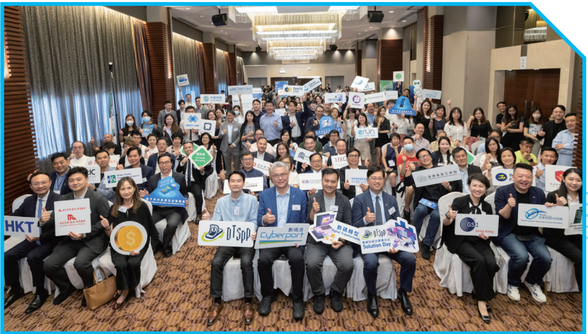
Start-ups enthusiastically embraced the opportunity provided by DTSP, offering 56 solution packages. 初創企業踴躍參與「數碼轉型支援先導計劃」，提供56套解決方案。

數碼港支援政府推動產業數碼轉型和商業化的舉措。於2023/24年度，我們受數字政策辦公室（前稱資料辦）委託，推出並管理「 數碼轉型支援先導計劃 」。在政府5億港元撥款的支援下，數碼轉型支援先導計劃加快了餐飲業及零售業中小企的數碼轉型，該計劃以一對一配對形式，為每間中小企提供最多資助項目總額的50%或港幣5萬元，以較低者為準，助力中小企在支付、店面銷售、線上推廣、客戶管理和優惠系統等方面推行現成的數碼解決方案。初創企業踴躍參與，提供了56套解決方案。為進一步提高參與度，數碼港學院分別以粵語及英語舉辦了兩場網上簡介會，向37個有興趣的商會介紹數碼轉型支援先導計劃。