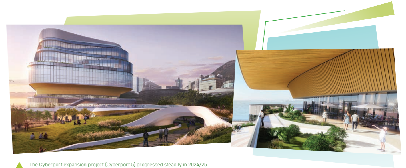
The Cyberport expansion project (Cyberport 5) progressed steadily in 2024/25. 数码港扩建计划(数码港第五期)于2024/25年度稳步推进。