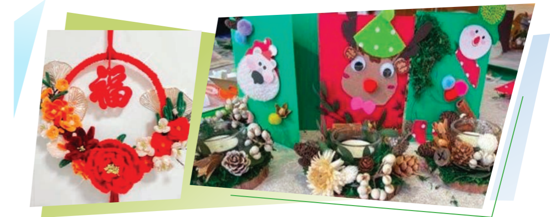
Cyberport organises regular creative workshops for staff and tenants to promote an active lifestyle and interaction among them. 数码港定期为员工及租户举办创意工作坊，借此促进积极生活方式和租户之间的互动。

The innovative "C3 Community-Owned Events" programme successfully empowered ecosystem members to organise initiatives with Cyberport's logistical and promotional support, including specialised cybersecurity workshops, low-code development seminars, global talent acquisition webinars and strategic marketing sessions. These member-driven events strengthened peer-to-peer learning and knowledge transfer throughout the start-up community.