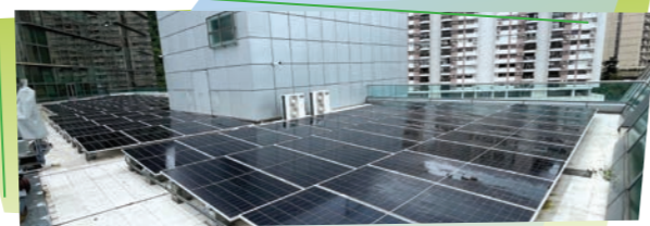
Solar energy infrastructure has covered Cyberport Tower 3, Tower 4A and Tower 4B. 太阳能基础设施已覆盖数码港3座、4A座及4B座。

Our expanding solar power infrastructure – comprising 317 photovoltaic panels spanning over 2,076m 2 of rooftop area at Cyberport 3, 4A and 4B – generated approximately 130,000 kWh of renewable energy this year, offsetting 86,000kg of CO 2 emissions, which is equivalent to the carbon absorption of 3,700 trees. This solar installation represents one of the largest commercial renewable energy installations in Hong Kong's technology sector.